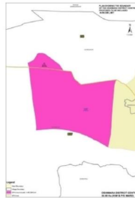
Oshiwara District Centre