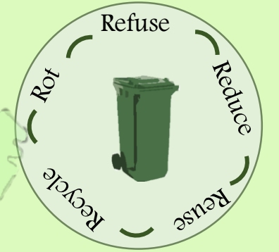
Solid Waste Management