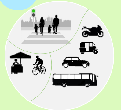
Road Space Management