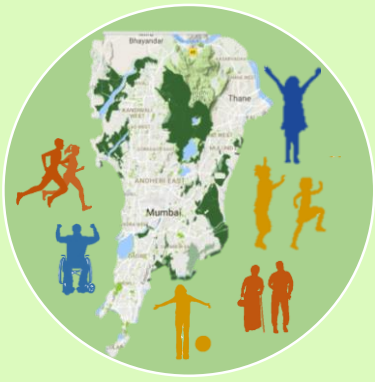
Public Open Spaces