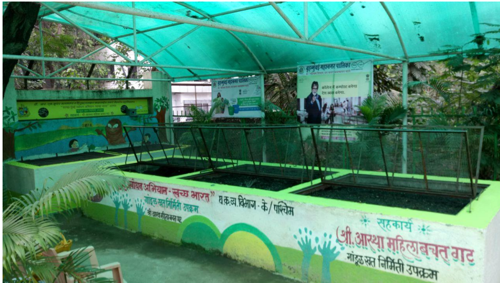
MCGM's Vermi-composting project at Cooper hospital run by "Aastha" women's Self-Help Group