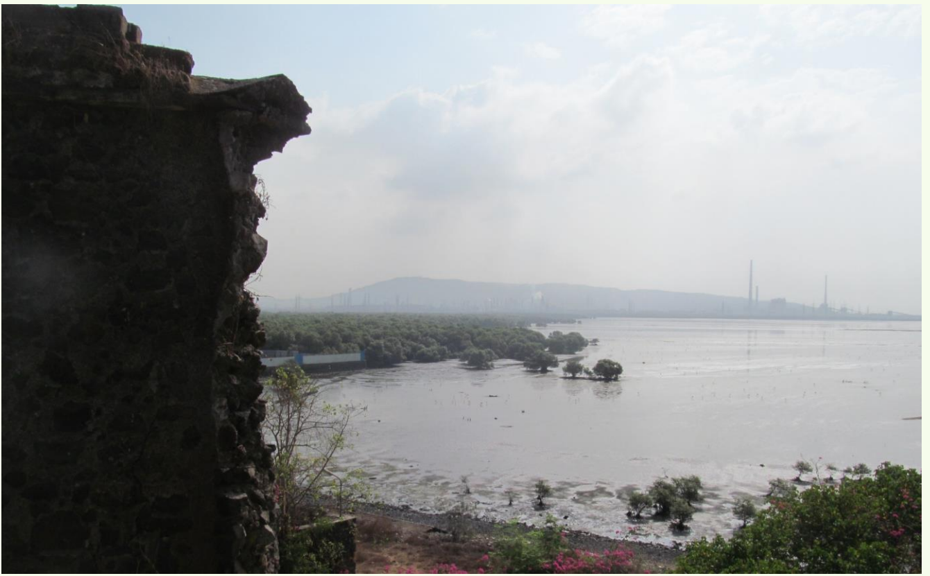
Fort Walls at Sewri overlooking the Mangroves and Flamingos along the Eastern Coast of Mumbai

“How wonderful it is that nobody need wait a single moment before starting to improve the world.”