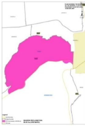
Bandra A Block