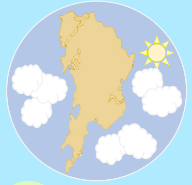
Quality of Air