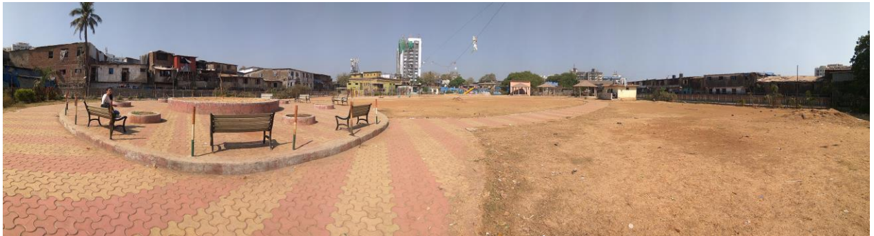
Panoramic View of W.I.T. Ground, Mahim

July 17, 2017: NAGAR’s site visit and proposal for WIT Ground in Mahim has been restructured as a case study of a public open space. to assert its stand that restoration of public open spaces can be done by the MCGM and this was communicated by letter to the Municipal Commissioner Mr. Ajoy Mehta.