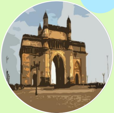
Built and Natural Heritage