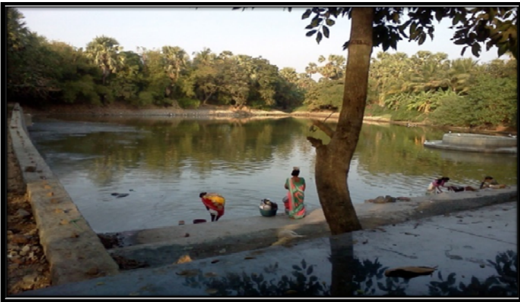
Karjadevi Talao, Manori,

The team working on 'Preservation & Restoration of Water Bodies and Beaches' prepared a case study on status of water bodies in P-North Ward, MCGM's largest ward (area-wise). They also prepared a booklet to guide citizens on what they can do to save, protect & conserve water bodies.