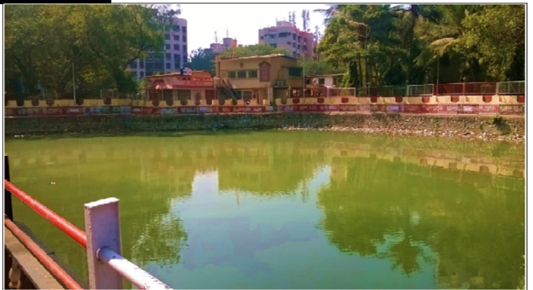
Bhaujale Talao / Somwar Bazaar Talao, Link Road, Malad West