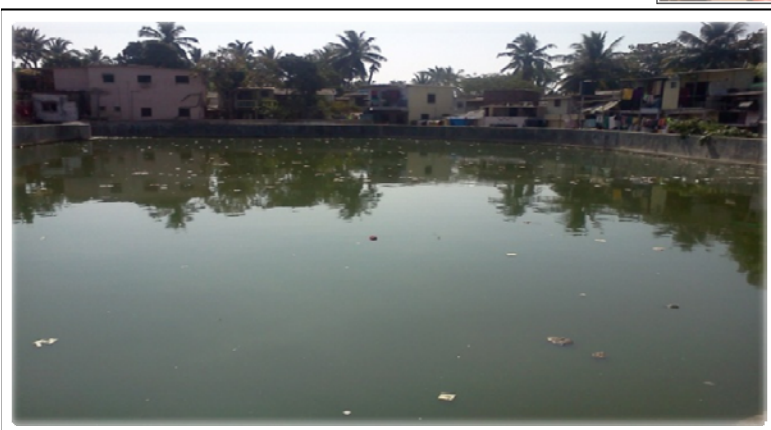
Malwani Talao, near Malwani church, Malad